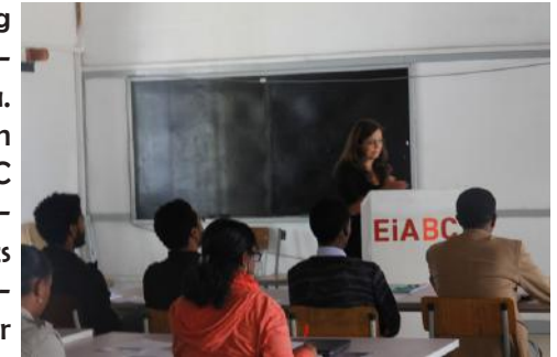
Workshop on "Safer Streets for Safer Mobility" June 23-25/2016 at EiABC campus

As well known, buildings are flourishing at every corner of the country particularly in the capital city, Addis Ababa. EiABC host three days workshop which is held from June 23-25/ 2016 in EiABC campus. It was part of capacity building initiative within EiABC and students towards planning, designing and implementing safer and sustainable streets for all users for the ongoing streets planning project in Addis Ababa.