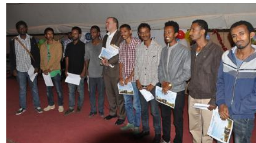
Winners of Bamboo Design Competition Award "Assosa Refugee Camp Architecture" Awarded During "World Refugee Day" Event on Friday, June 17/2016.

There was a world refugee day celebration in Beneshangul Gumuz regional state capital Assosa on June 17, 2016. On the occasion, Bamboo design competition was carried out by (EiABC) and the National Bamboo Construction Center (NBBC) in cooperation with and funded by German Development Cooperation (GIZ) having the objective of promoting Bamboo industry in Ethiopia.