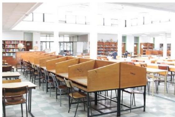
Ethiopian Institute of Architecture and Building Construction Library

As a result of the growth of institutional capacity in different educational streams, the number of students using the library is increasing year after years. Hence the existing resources also need to increase both qualitatively and quantitatively.