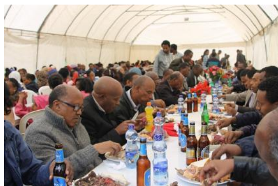
EiABC's staff get together on August 4, 2016 at EiABC campus

Unless a healthy sense of team work and belongingness is built and cultivated among the employees of any organization, there will be no shared performance, no joint work effort and no mutual accountability. Hence, a collaborative work culture in a given institution is highly encouraged.