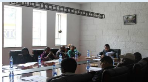
EiABC's top and middle level management meeting on 2008/2016 annual report

There was a meeting held in EiABC on 19 July 2016 to discuss on the institute's annual report. Participants of this meeting were department heads, team leaders and one-to-five work group team leaders.