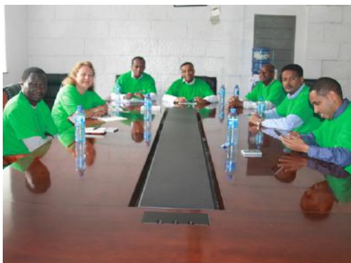
An environmental day celebration on July 5, 2016 at EiABC campus

An environmental day was celebrated on July 5, 2016 at EiABC campus. The main objective of celebrating environmental day was to enhance the awareness of people about the importance of trees in human life and to mobilize the youth to build awareness of climate change and the impact of hazardous carbon emission which could totally distort the environment and the threats it has on the existence of life on earth.