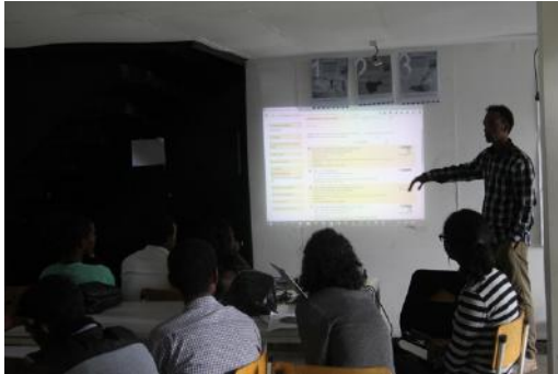
An online publication workshop held at EiABC campus

EiABC publication center in collaboration with the EiABC's publication Center and Creative Commons in Ethiopia organized the first online publication workshop at EiABC campus from June 25-29/2016.