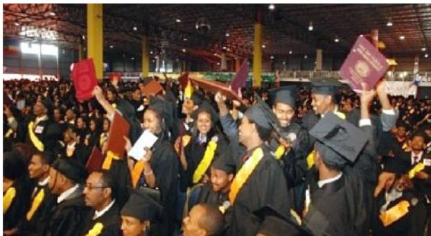
Addis Ababa University's graduation ceremony class of 2008/2016 held at Millennium Hall

On July 9/2016 Addis Ababa University graduated more than 8,000 students at Millennium Hall. Prime Minister Hailemariam Desalegn, current Malawi President Piter Mutarika, government officials and other invited guests attended the graduation ceremony.